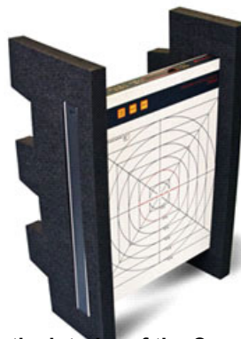
Vertical Elevation Use

Foam Elevation Support Stand fits inside the interior of the Carry Case lid