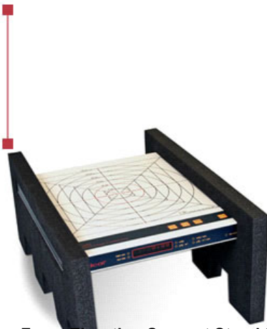
Horizontal Elevation Use