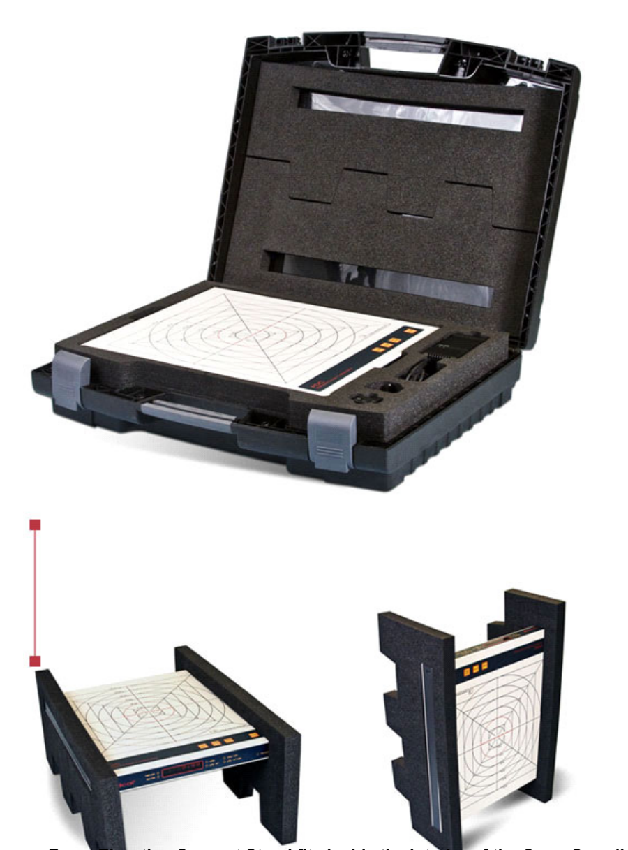
Foam Elevation Support Stand fits inside the interior of the Carry Case lid Horizontal Elevation Use Vertical Elevation Use